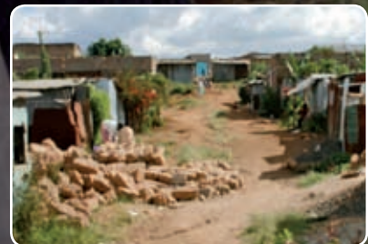
Main: SOS youth helps a refugee erect his tent in Eldoret, Kenya. Inset: Community on the outskirts of Nairobi affected by violence.