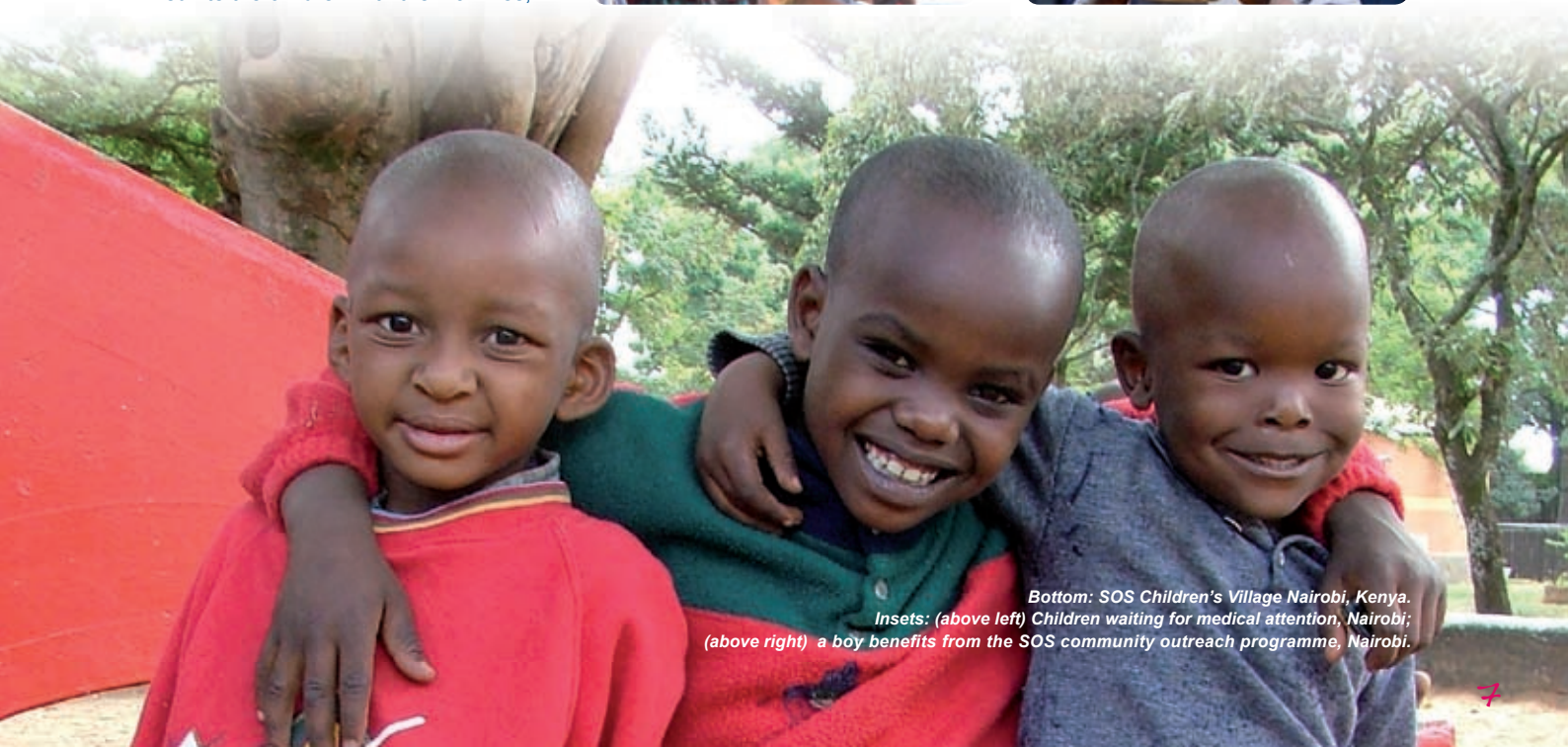
Bottom: SOS Children's Village Nairobi, Kenya. Insets: (above left) Children waiting for medical attention, Nairobi; (above right) a boy benefits from the SOS community outreach programme, Nairobi.