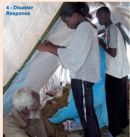
4 - Disaster Response