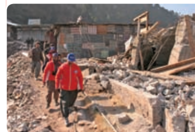
Top: Family with their new house constructed by SOS Emergency Relief Programme Puthupettai, Cuddalore, India. Inset (l-r): A survivor of the floods in Concepción, Chile; SOS staff and helpers distribute tents after the tsunami, Yogyakarta, Indonesia; SOS workers search for survivors after the Pakistan earthquake.