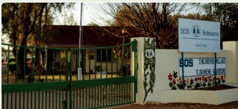
Photographs and interview by Mats Ögren