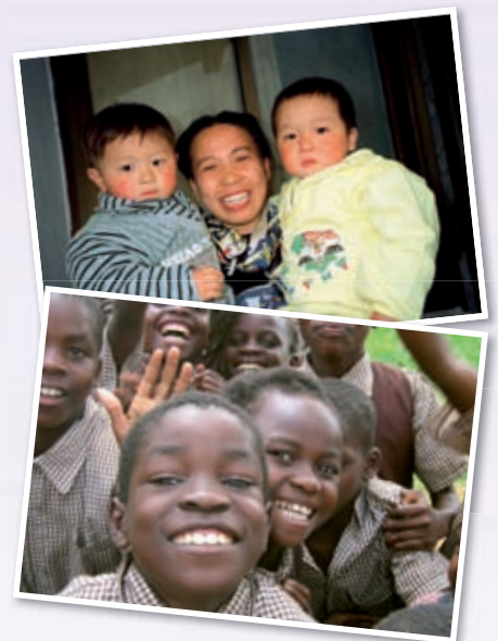
Insets: (top) An SOS mother with her twins, Kaifeng, China; (above) SOS children from Zambia.