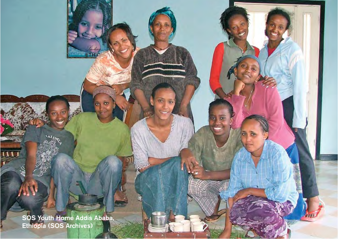
SOS Youth Home Addis Ababa, Ethiopia