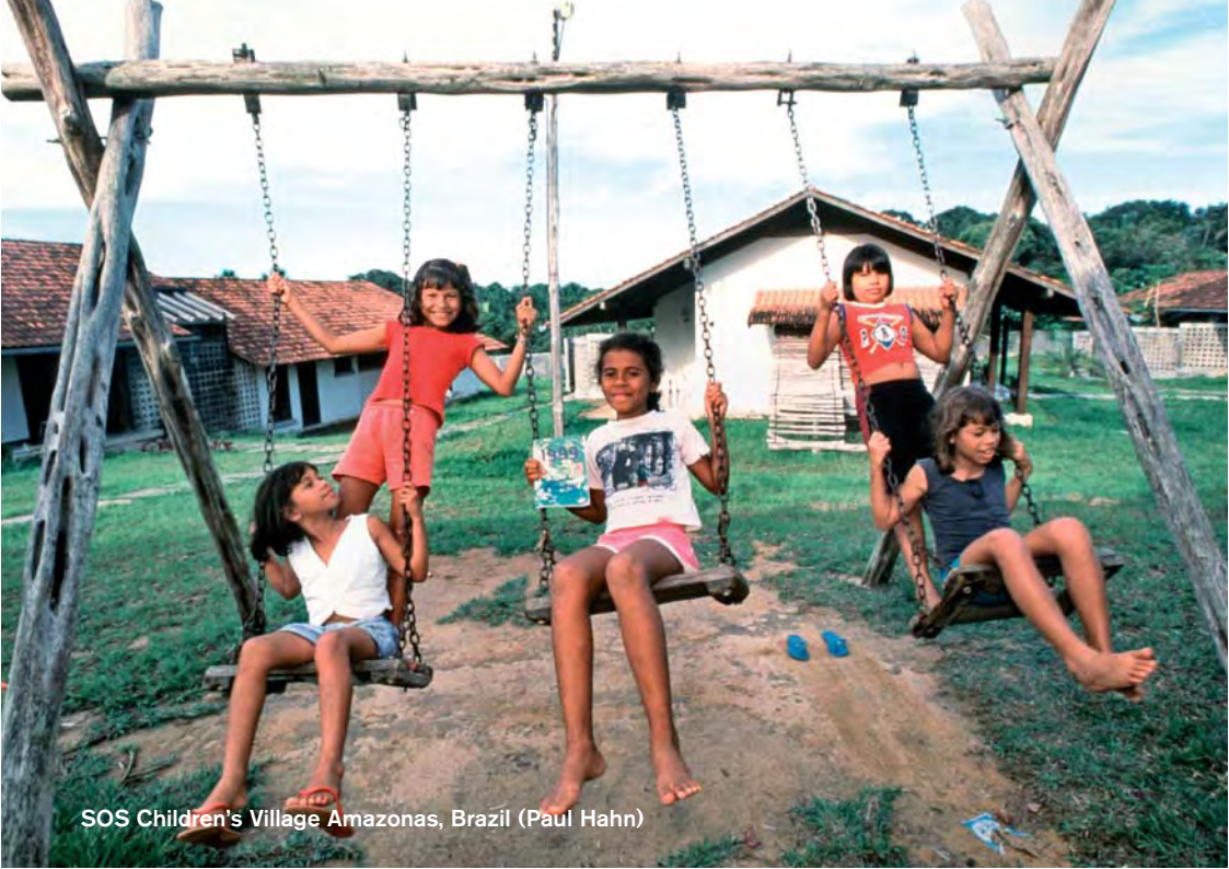
SOS Children's Village Amazonas, Brazil