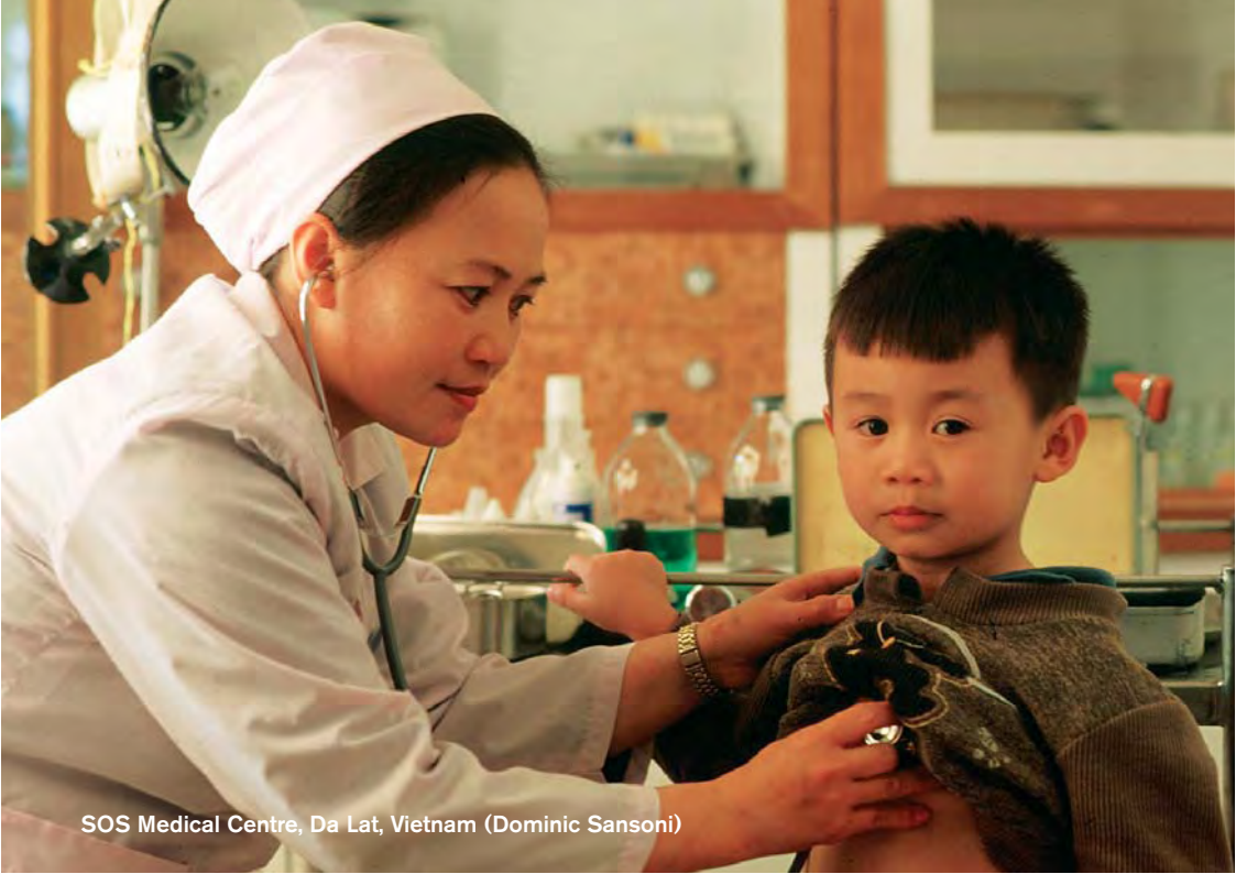
SOS Medical Centre, Da Lat, Vietnam