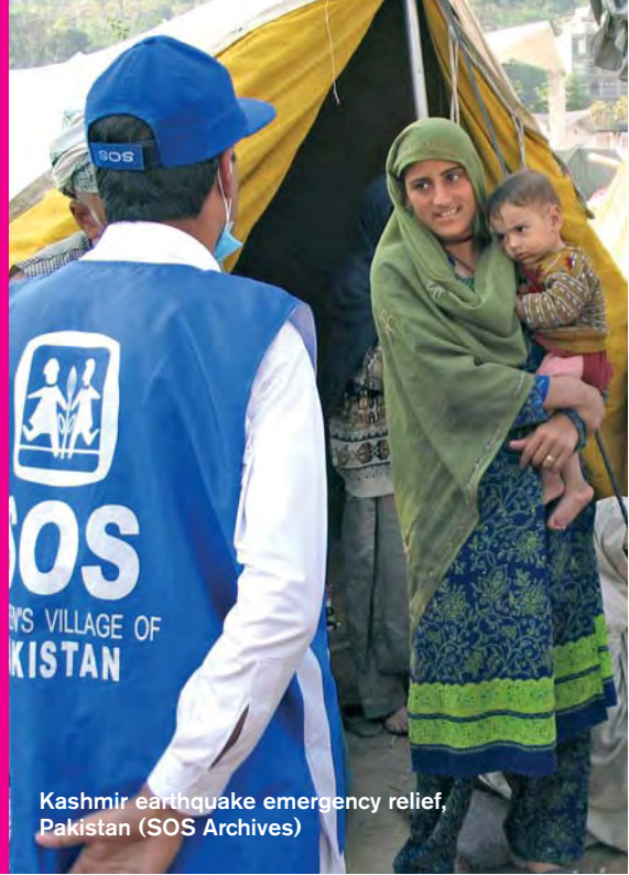
Kashmir earthquake emergency relief, Pakistan

Many children have been reunited with their families; others have found a new home in an SOS Children's Village. Many more, initially cared for in an emergency shelter in Rawalpindi, will benefit from two new children's villages and three new schools.