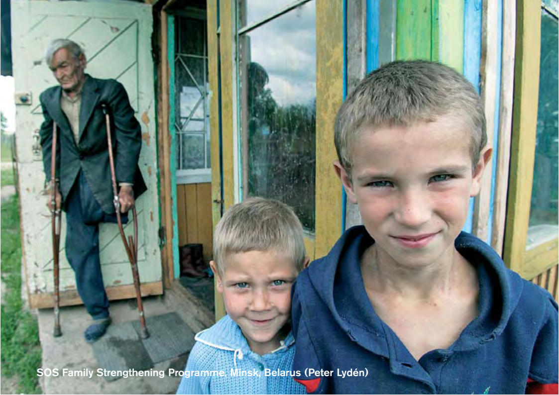
SOS Family Strengthening Programme, Minsk, Belarus