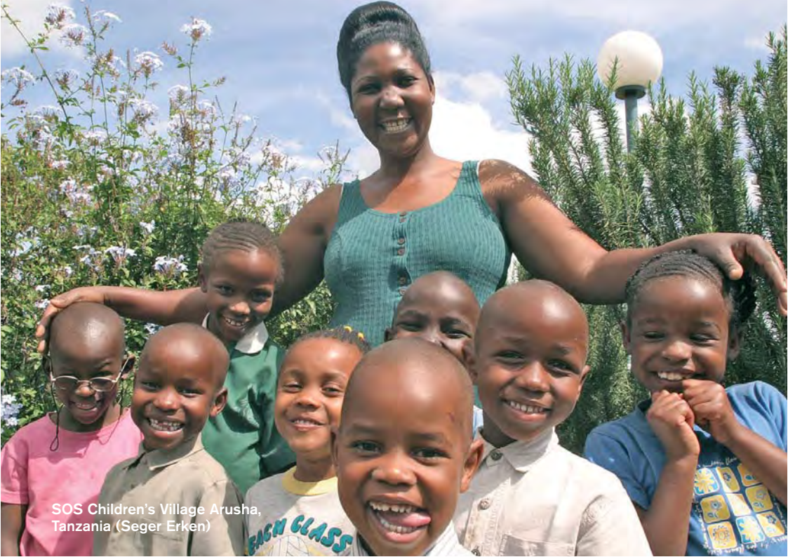
SOS Children's Village Arusha, Tanzania (Seger Erken)