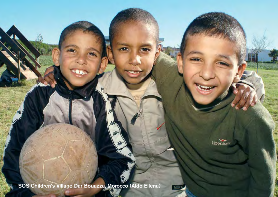
SOS Children's Village Dar Bouazza, Morocco (Aldo Ellena)