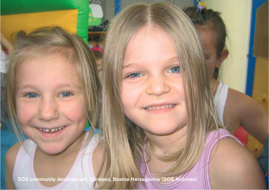
SOS community development, Sarajevo, Bosnia-Herzegovina