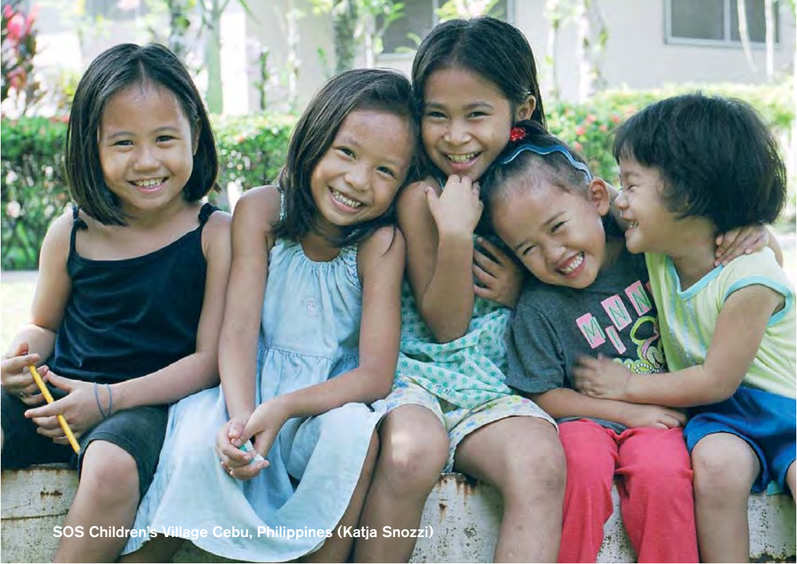
SOS Children's Village Cebu, Philippines (Katja Snozzi)