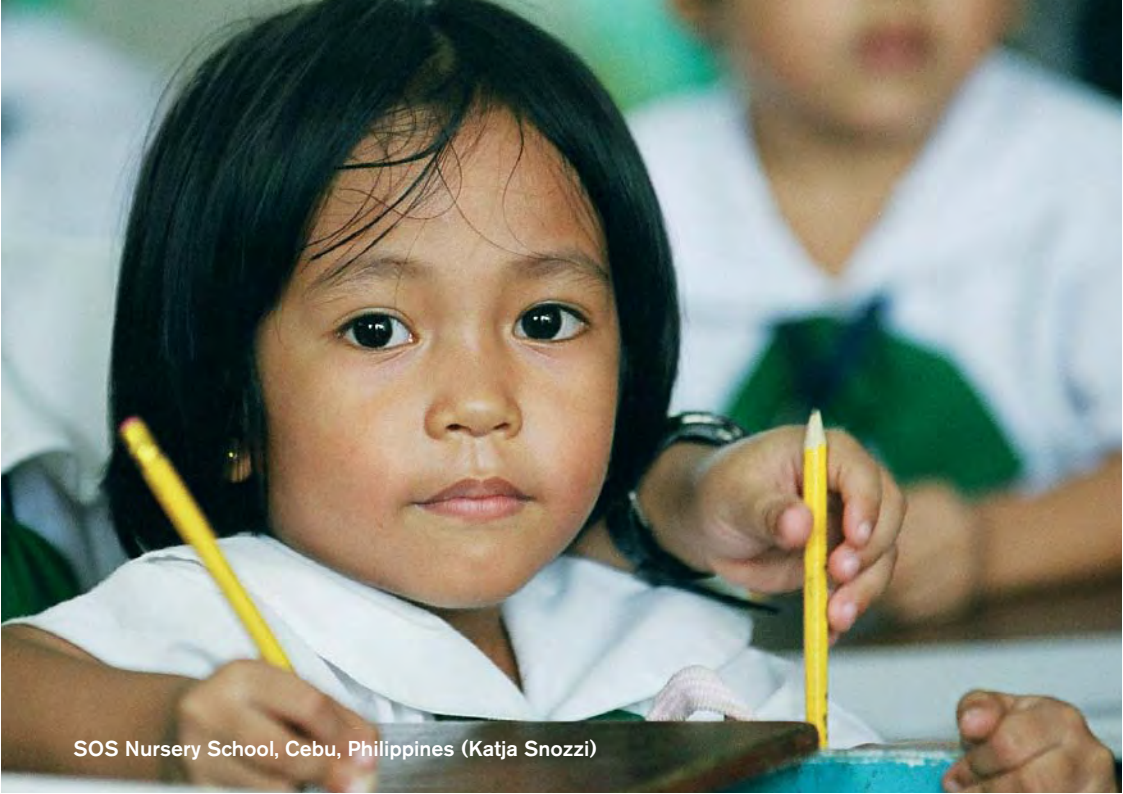
SOS Nursery School, Cebu, Philippines