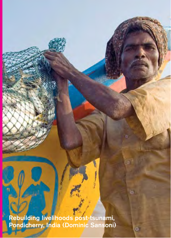
Rebuilding livelihoods post-tsunami, Pondicherry, India (Dominic Sansoni)