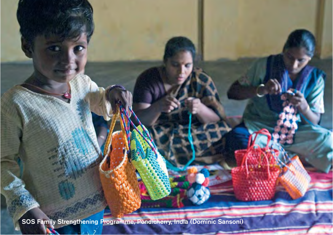
SOS Family Strengthening Programme, Pondicherry, India (Dominic Sansoni)